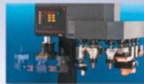
16 支刀換刀系統 16 Tool changer system