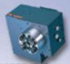
C軸旋轉頭系統 C-Axis system