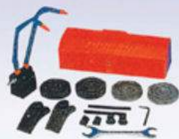
工具箱 Tool box