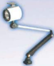
石英工作燈 Halogen light