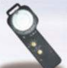
電子手輪遙控器 Electronic MPG